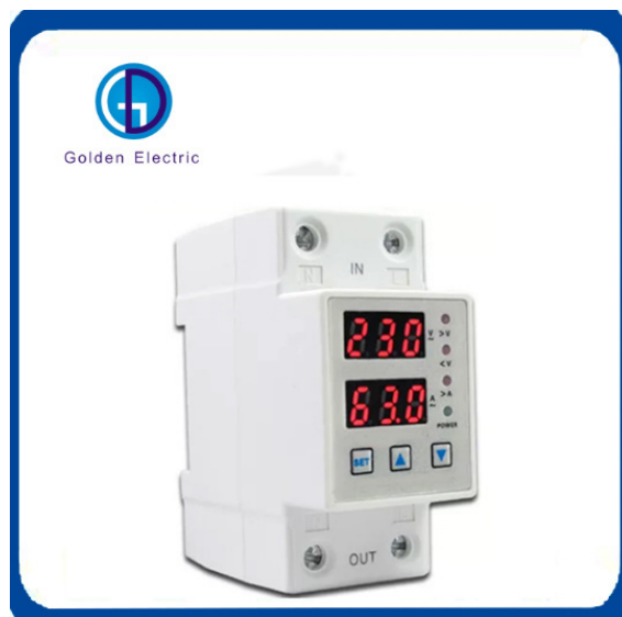
Single Phase Voltage /Current Protector