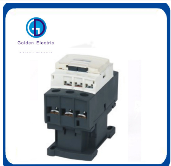
AC Contactor Magnetic Contactor