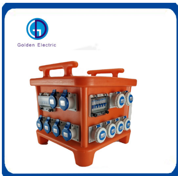
Instrial Plastic Power Combination Socket Box