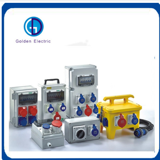
Distribution Box Waterproof Plastic Industrial Socket Box