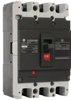
MCCB Moulded Case Circuit Breaker