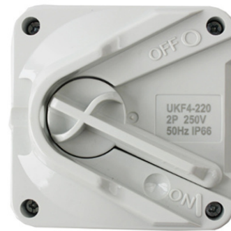
Weatherproof Mini Isolator Switch