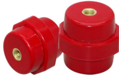
Sm Drum Bus Bar Sm Insulator