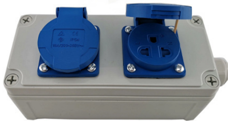
Waterproof Socket Industrial Socket Box