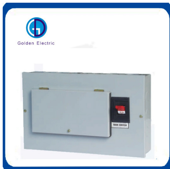
Single Phase Plug-In Type Metal Enclosure Distribution Box