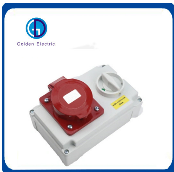
Waterproof Industrial Interlock With Switch