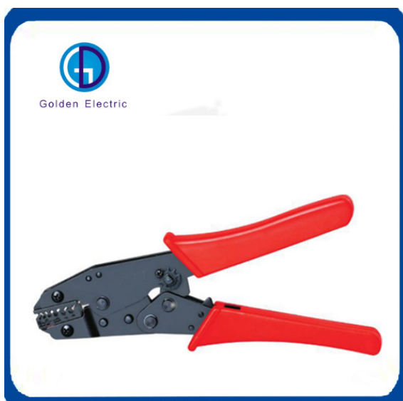
Ratchet Solar PV Crimping Tools for Solar Panel Connectors Switch