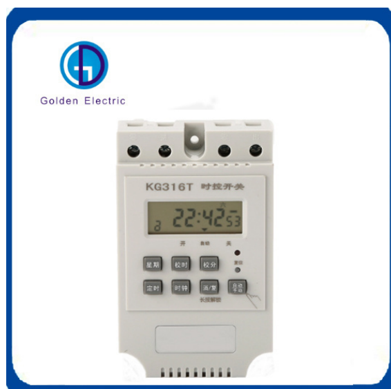
Time Delay Switch Programmable Timer Switch