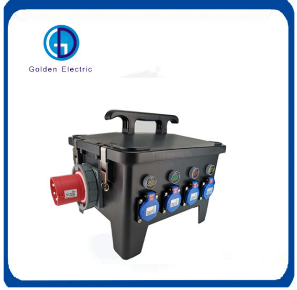
Waterproof Socket Industrial Socket Box