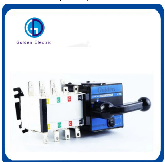
Automatic Transfer Switch / Change Over