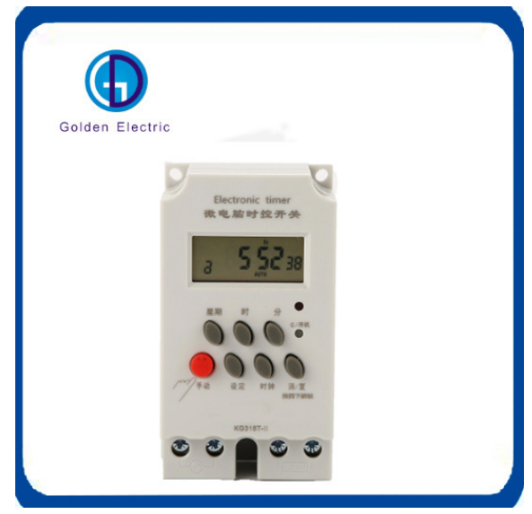
Digital Timer / Control Switch