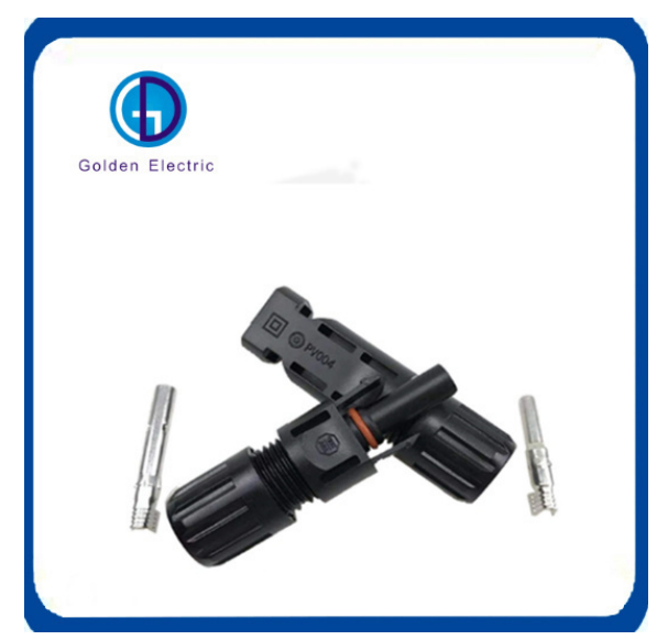
Mc4 1 Input 1Output PV Cable Coonector