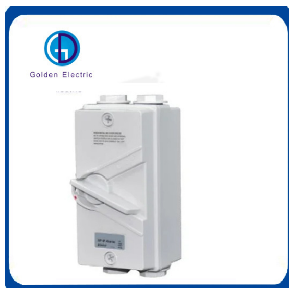
UKF Wertherproof Isollator Switch