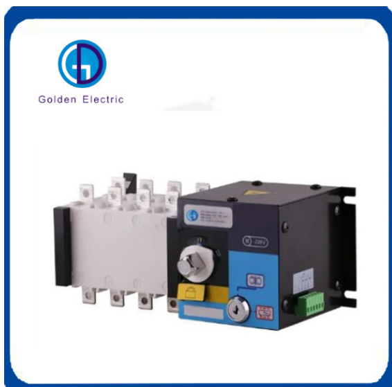
Automatic Transfer Switch / Change Over Switch