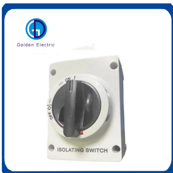
DC Isolator Waterproof Switch /PV Isolator