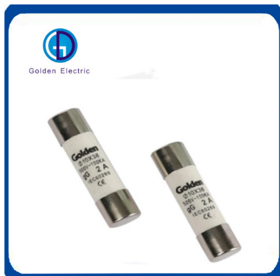
DC Ceramic Fuse Holder and Fuse for Solar PV