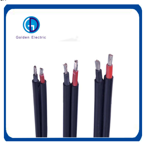
TUV Single Core /Double Core Power PV Splar