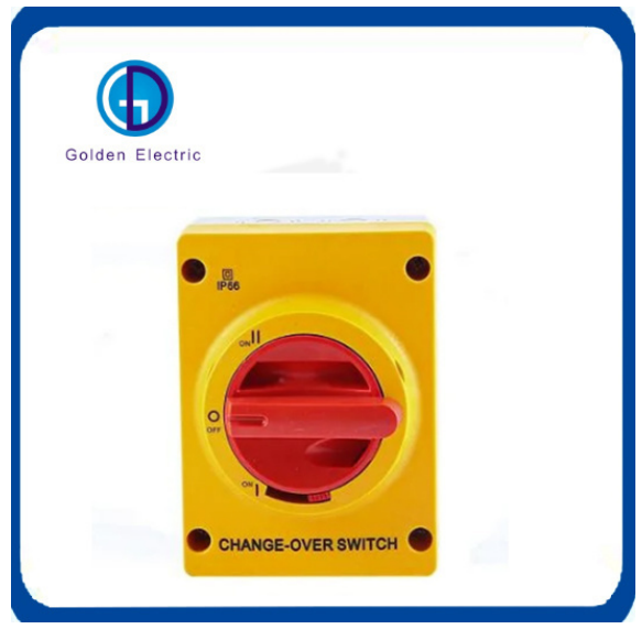
Weatherproof AC Rotary CHANGE -Over