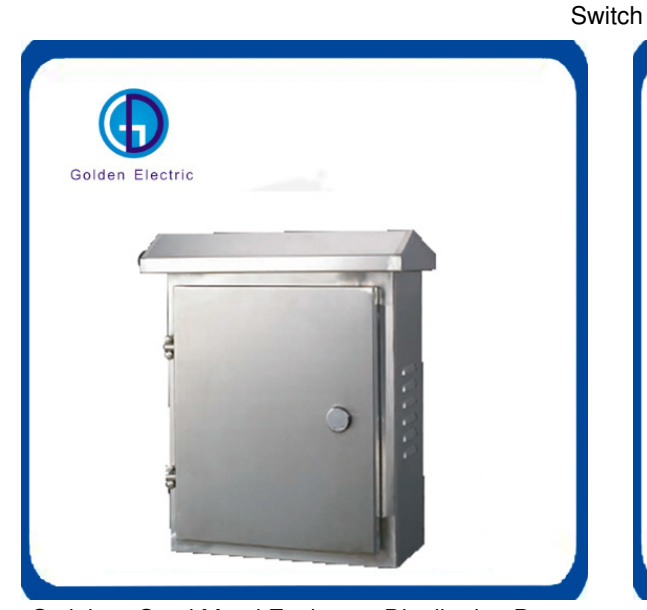
Stainless Steel Metal Enclosure Distribution Box