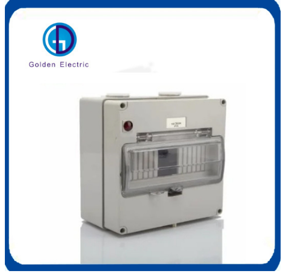
Weatherproof Plastic Electric Distribution Box