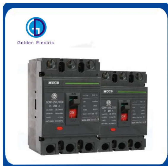
DC Moulded Case Circuit Breaker Switch for Solar System