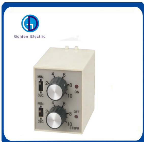
Adjustable Super Time Relay