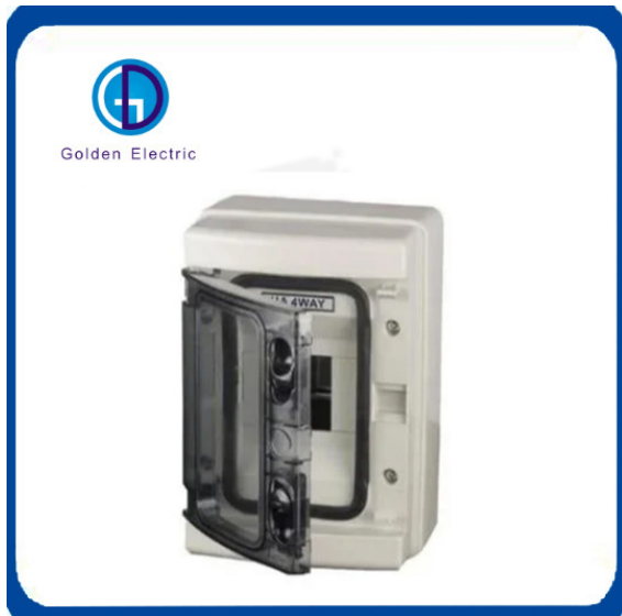
Plastic Waterproof Electrical Distribution Box