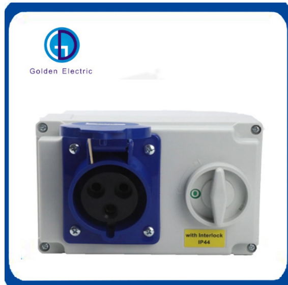
Industrial Receptacle and Switch with Interlock Device