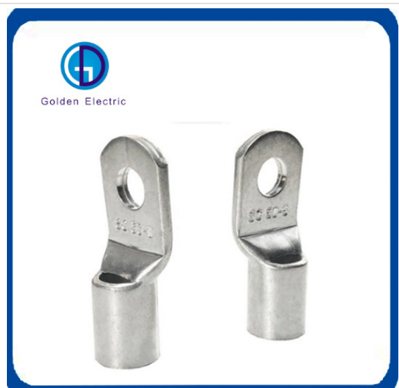
Cable Connector for Cable End Termination