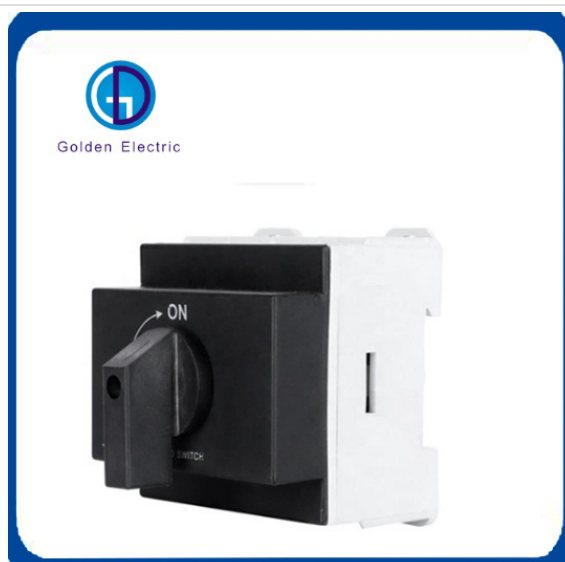
Solar Isolating Disconnect PV DC Isolator Switch